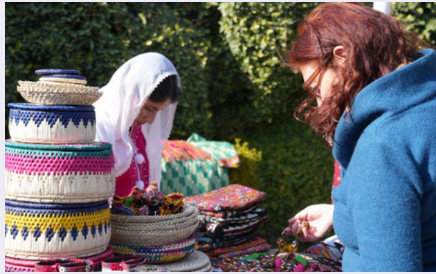
A woman displays her products at the launch of the Catalyzing Growth for Women's Economic Empowerment Project 2025.