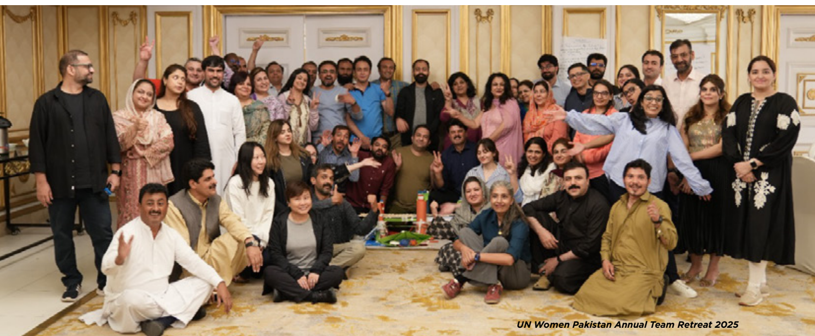
UN Women Pakistan Annual Team Retreat 2025

BUITEMS, with support from UN Women, WDD, and the German Embassy, launched Balochistan's first Gender Parity Report, marking a milestone for gender data and policy in the province.