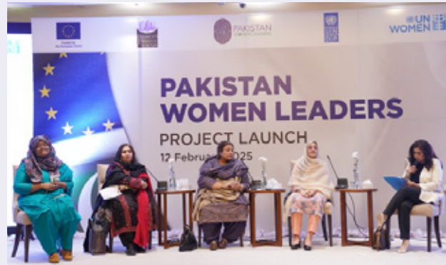
Panel Discussion at Launch of Pakistan Women Leaders Project 2025