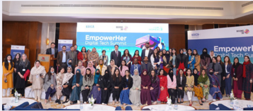
KOICA funded EmpowerHer: Digital Tech Summit

Despite technological advances, women remain significantly underrepresented in the digital