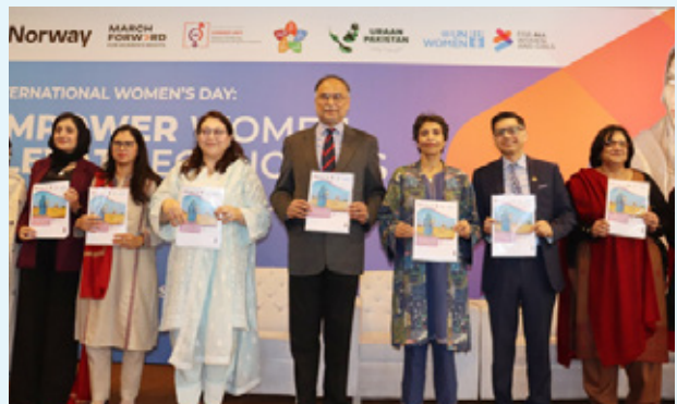
UN Women and partners unveil the Gender Action Plan 2025–26 on International Women’s Day. 2025