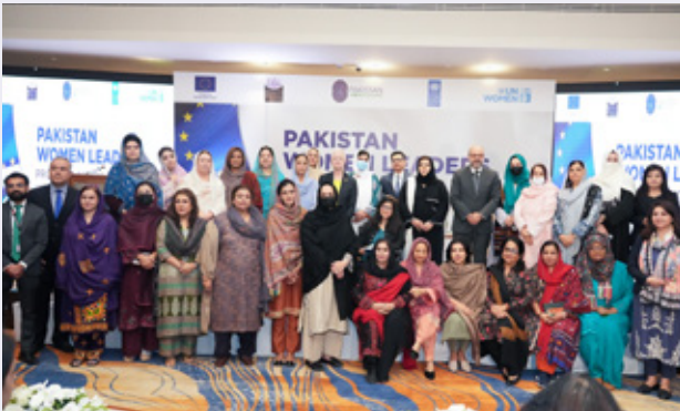
Launch Ceremony of EU funded Pakistan Women Leaders Project 2025

Focusing on 15 districts with low female voter registration, the project prioritizes electoral participation, leadership capacity-building, gender-responsive reforms, and combating online harassment. It also seeks to connect women leaders and grassroots activists through robust leadership networks.