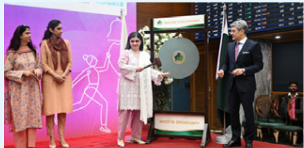
UN Women joins PSX and partners to ring the bell for gender equality and amplify women’s leadership in the corporate sector.

At the Prime Minister’s House, ten companies were recognized for family-friendly policies, while the Ring the Bell for Gender Equality event with the Pakistan Stock Exchange promoted women’s leadership in finance.