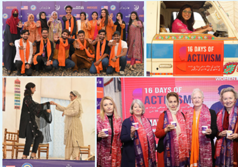
Glimpses from the 16 Days Campaign 2024 in Lahore, Karachi (Top) Mardan and Peshawar (Bottom)

With strong media and grassroots outreach, the campaign’s impact echoed far beyond 16 days — advancing the call for a just, equal, and violence-free society.