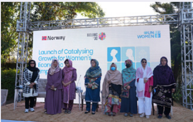
Home-based workers at the launch of the Catalyzing Growth for Women's Economic Empowerment Project 2025

Together, both initiatives reaffirm UN Women's dedication to enabling women across Pakistan to lead, thrive, and shape a more inclusive future.