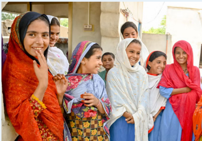
School Girls in Sukkur, Sindh 2023