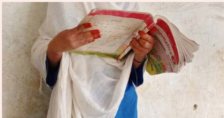
Yasmin Gul's daughter in a school uniform 2024

The year 2025 marks the 30th anniversary of the Beijing Declaration and Platform for Action—a visionary women's rights agreement endorsed in 1995 by 189 governments. It provided a blueprint of actions to end discrimination and violence against women and girls that hold them back from education and opportunities. It was also the first global policy document on women that included a specific focus on girls' rights. These actions remain relevant and urgent today, as women like Gul and her daughters continue to fight for basic rights.