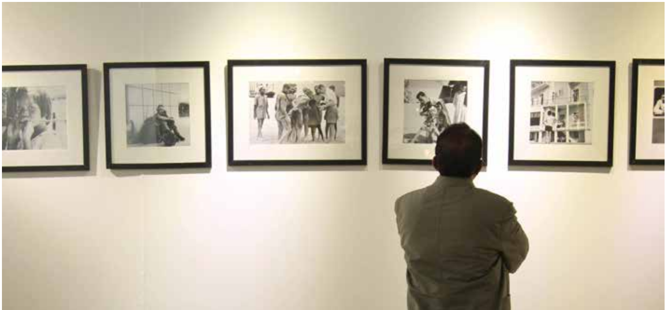
Photo exhibition “Pakistani People and United Nations - Human stories through photography” opens at Frere Hall in Karachi

The photo exhibition, “Pakistani People and United Nations - Human stories through photography”, opened on 20 January 2016 at the Frere Hall in